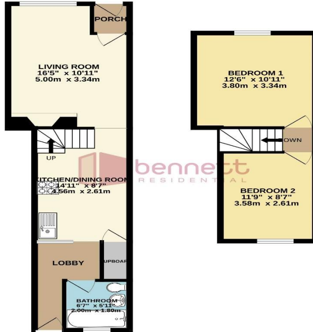
1ST FLOOR 265 sq.ft. (24.5 sq.m.) approx.

TOTAL FLOOR AREA: 661 sq.ft. (61.4 sq.m.) approx. Whilst every effort has been made to ensure the accuracy of the floorplan contained here, measurements of doors, windows, rooms and any other items are approximate and no responsibility is taken for any error, omission or mis-statement. This plan is for illustrative purposes only and should be used as such by any prospective purchaser. The services, systems and appliances shown have not been tested and no guarantee as to their operability or efficiency can be given. Made with Metropix ©2024